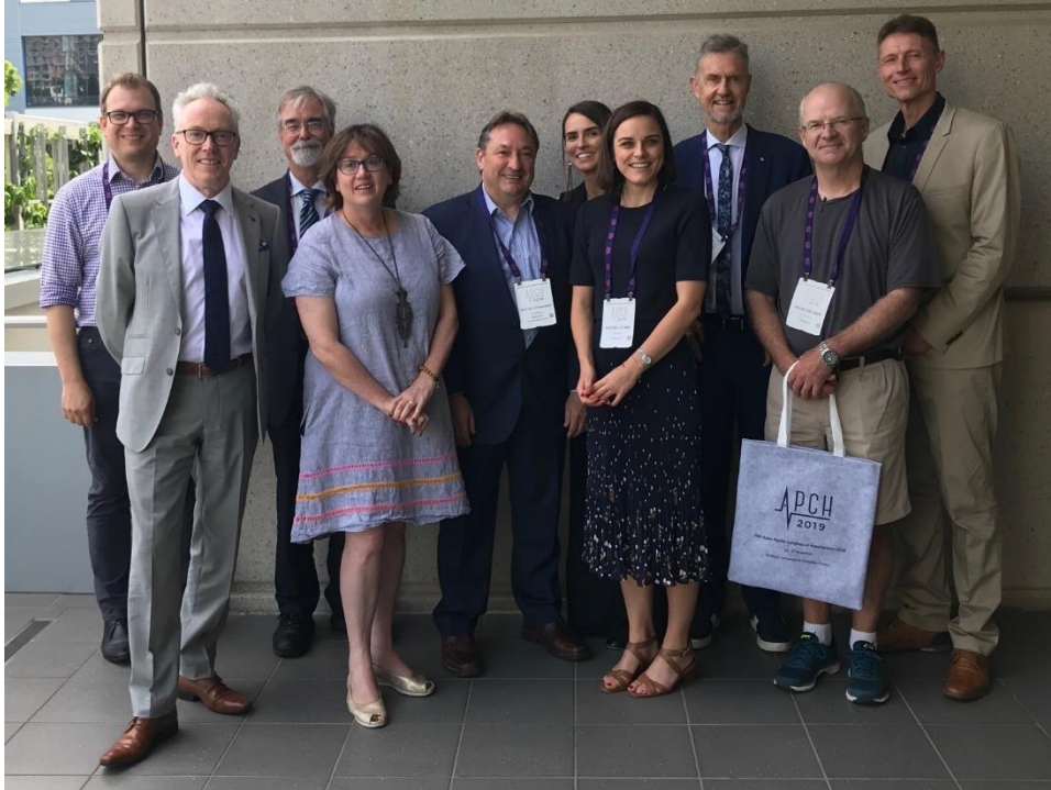
Previous HBPRCA Executive Committee.